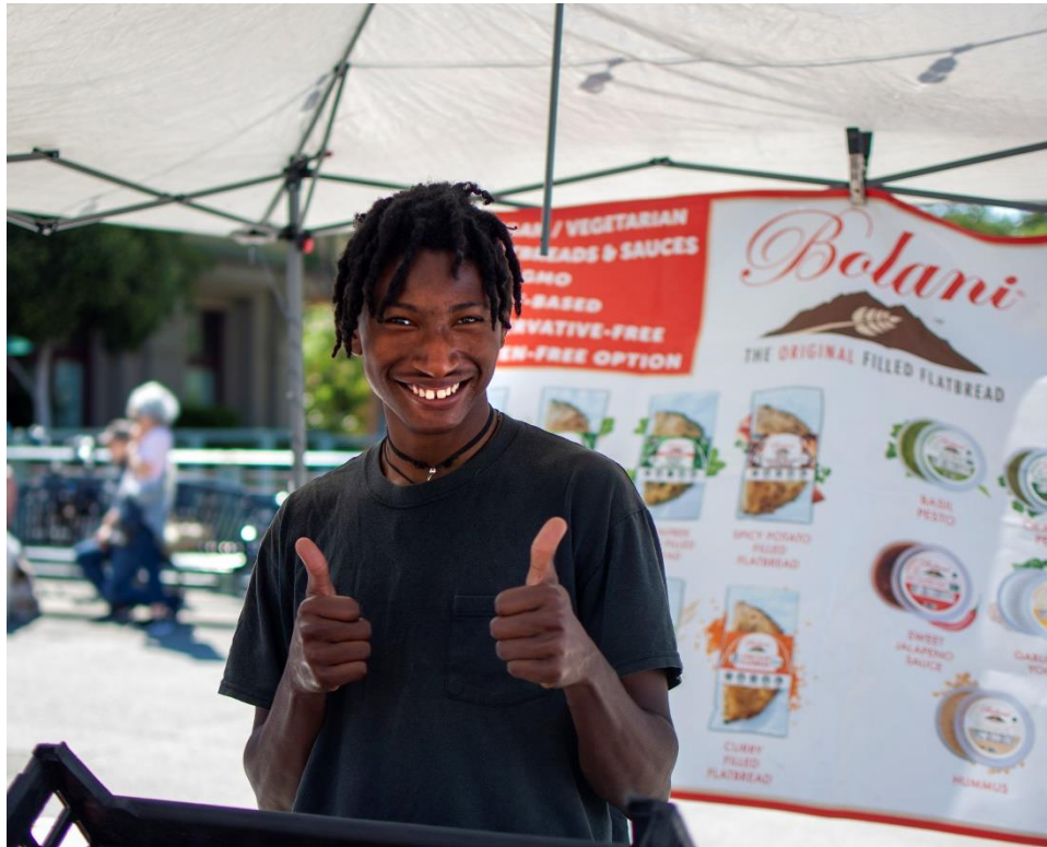
Small Business at Martinez Farmer's Market

Policy LU-P-11.2: Promote City marketing and branding efforts and support similar coordinated private business efforts.