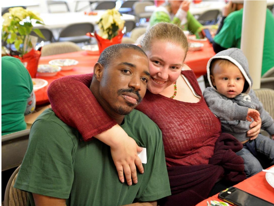
Martinez Residents