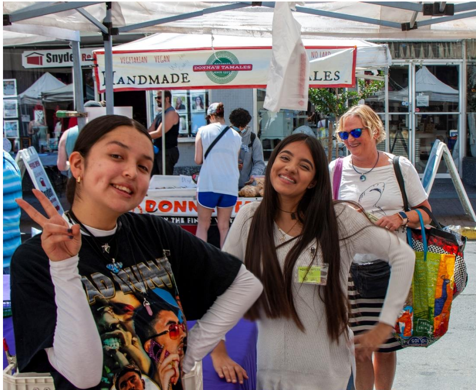
Martinez Youth Volunteers

As a mature community, it is critical that Martinez think strategically about how and where reinvestment should occur and where it is appropriate for limited new development to take place. The overarching goal is to conserve those parts of the City that have value the way they are and to direct redevelopment to areas where land may currently be underutilized.