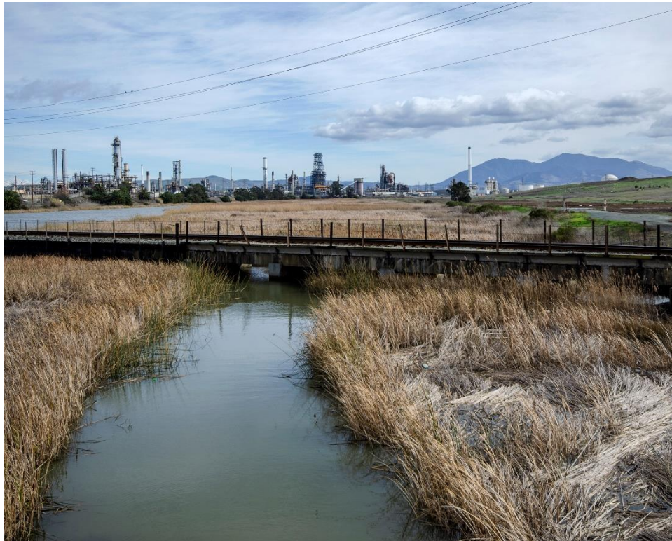
View of Refineries from Martinez Marshlands