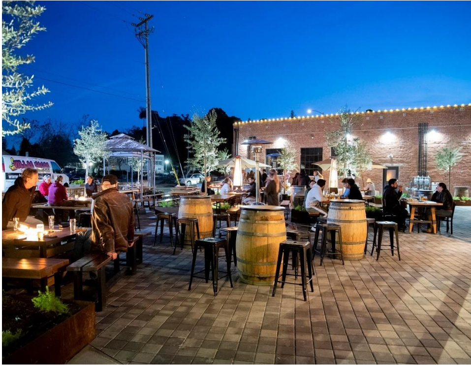
Downtown Martinez Nightlife