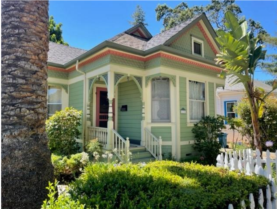
Victorian Home in Central Martinez