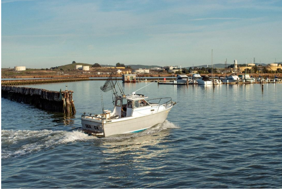
Martinez Marina

that are subject to flooding as set forth in maps prepared by the Federal Emergency Management Agency (FEMA) or the Department of Water Resources. This information is described through text and figures, which establish the blueprint for future land uses and demonstrate how these uses are integrated with other General Plan elements and policies.