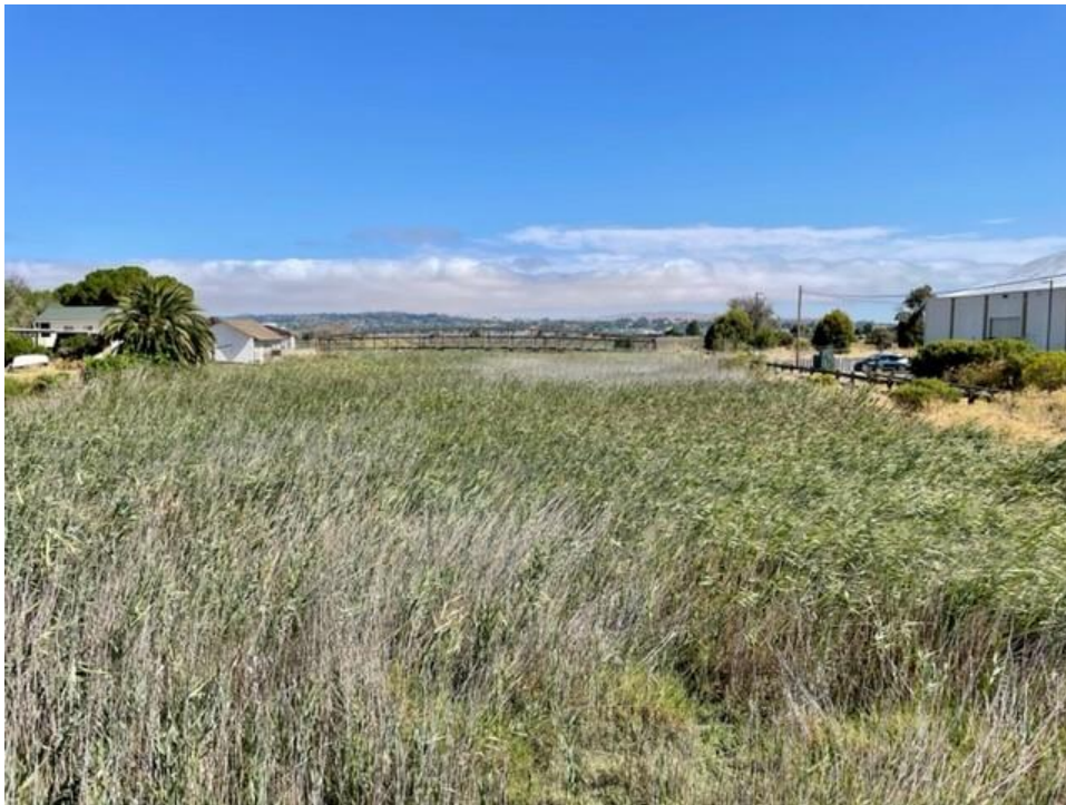
View east of former Granger's Wharf

Natural topography is often preferred as open space and can be property owned by the City or other public agencies (i.e., East Bay Regional Park District, National Park Service, etc.) for the purpose of public recreation and/or preservation of scenic and natural resources, or it may be private lands with land use regulations or easements restricting use to open space. Examples of unique natural areas include the waterfront; City/East Bay Regional Park District lands at Franklin Hills and Shoreline; wetland areas; Mt. Wanda; Schaefer Memorial Open Space; and Hidden Lakes and Roanoke (Virginia Hills) open space areas. These defining natural topographic features may include private lands that have either extreme constraints to development, such as steep slopes or scenic resources to preserve.