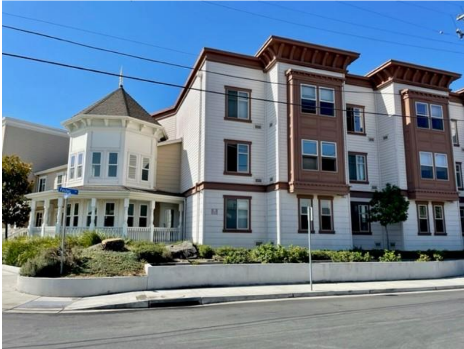
Medium Density Housing west of Downtown Martinez