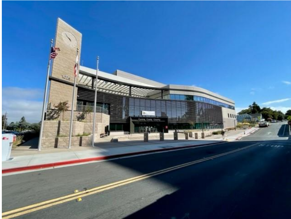
Contra Costa County Administration Building in Downtown

Downtown Shoreline: The portion of the Downtown Shoreline north of the railroad contains two distinct sub-areas: 1) the existing residential Granger’s Wharf neighborhood along Berrellesa Street and 2) the industrial uses along Embarcadero Street. The Granger’s Wharf area retains its historic character from the Italian Fishing Village that existed before commercial fishing was banned along the Carquinez Strait in 1957. The established residential uses and character of Granger’s Wharf should be maintained, although expansion of East Bay Regional Park District’s facilities, as the access into the wetlands portion to the Radke Martinez Regional Shoreline, may be considered. Limited recreation oriented commercial uses may also be possible in the Granger’s Wharf area.