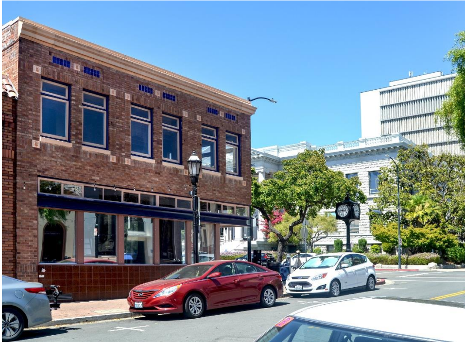
Downtown Martinez