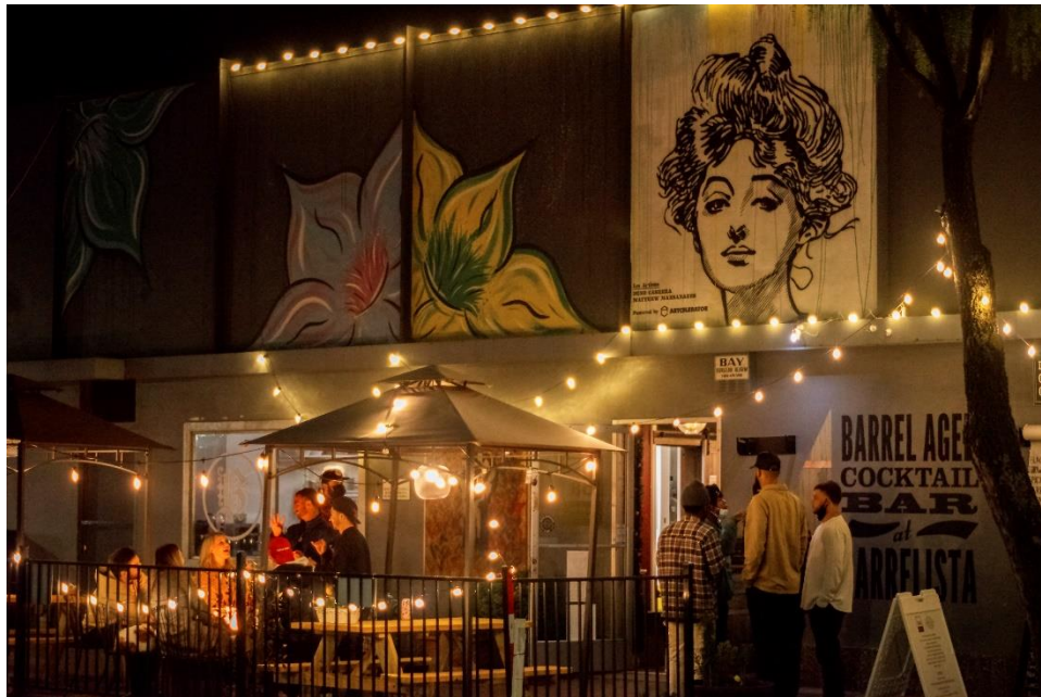
Martinez Nightlife

Policy LU-P-12.6: Develop a plan for pedestrian connections in the Downtown such as plazas and paseos.