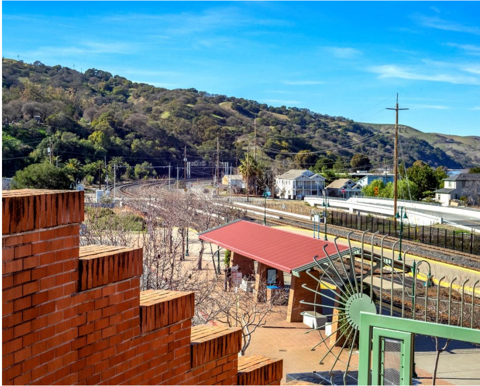
View of Franklin Hills

Downtown Neighborhoods: This area surrounding the Downtown Core is defined by the presence of existing older service commercial/industrial and eclectic uses. It is an area in transition and, as such requires balancing retention of current uses, while encouraging the ultimate replacement of such uses with a variety of more intense uses which can better define a traditional mixed-use urban environment and encourage the introduction of more residential uses as outlined in the 2006 Downtown Specific Plan .