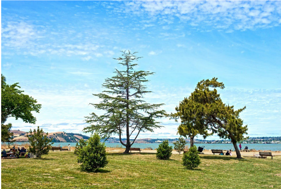
Radke Martinez Regional Shoreline