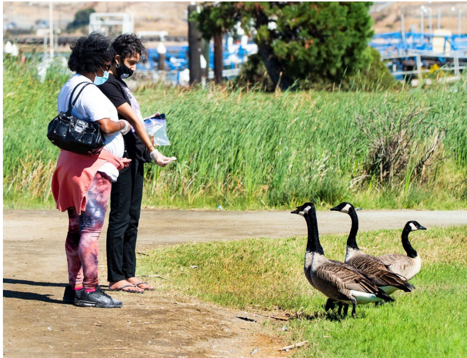
Radke Martinez Regional Shoreline

For each service, current conditions and concerns are summarized and issues that are projected to arise during the life of the General Plan, if any, are identified. The General Plan intentionally provides only a brief description of these services to frame the goals and policies. Several are addressed in greater depth in their own stand-alone document. These documents are noted in the appropriate sections below.