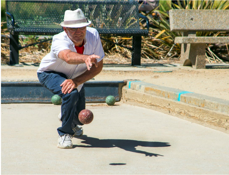
Ken Bothée Bocce Courts at the Martinez Bocce Courts Complex

Historic Train Depot: The depot is located at the north end of Ferry Street and is the site of the original Central Pacific depot of 1877. It became a Southern Pacific depot in the 1880s, and later served as the Amtrak depot until a new Amtrak station opened in 2001. Plans for future use of the depot include a potential museum or commercial use.