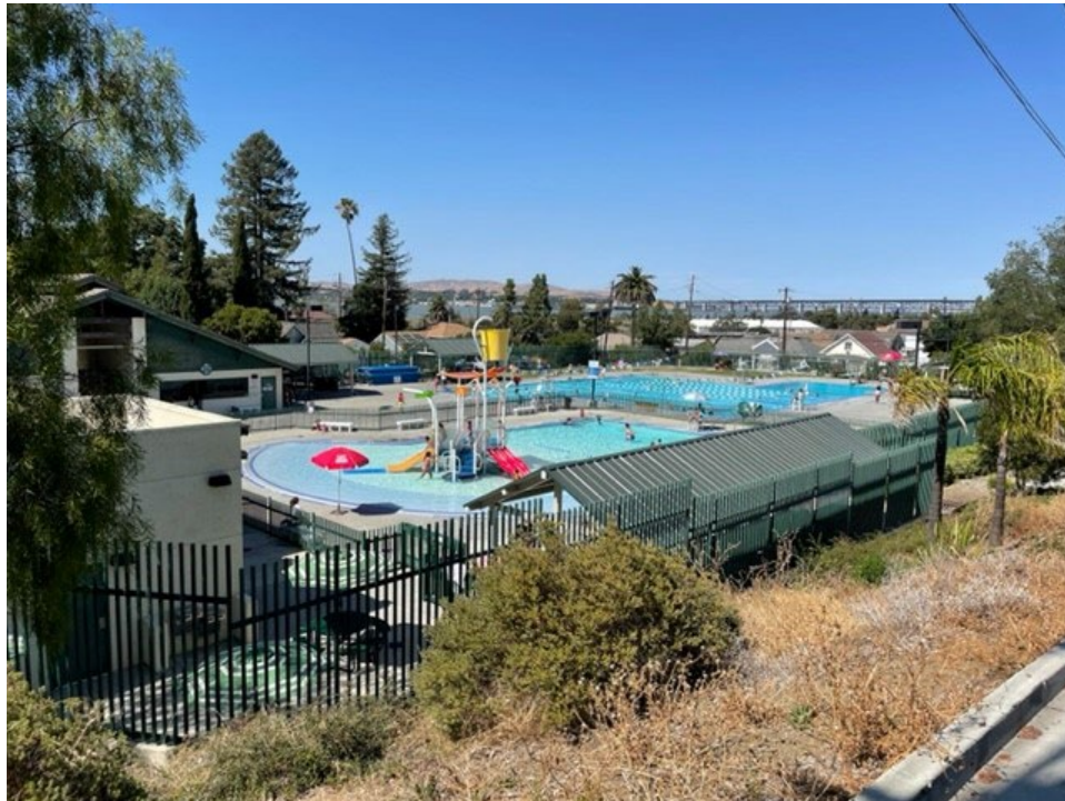
Rankin Aquatic Center

Martinez Marina: For more than 55 years the Martinez Marina has been supporting boating and fishing enthusiasts from the Martinez area and beyond. The Marina includes a boat launch ramp, fishing pier, boat slips, and harbor master building. The landward side of the Marina includes lands leased from the City to private recreational uses, including the Sea Scouts facility, the Bait Shop, a retail marine shop, and the Yacht Club – a social fraternal organization related to boating endeavors. Future work may include more dredging, breakwater seawall repair, and entrance reconfiguration contingent upon the availability of public and private funding. The City continues to maintain the Marina by upgrading facilities and continued dredging of the water channel. A separate Marina and Waterfront Trust Land Use Plan will be developed to increase recreation opportunities for the area and financial stability for the on-going maintenance needs of the Marina.