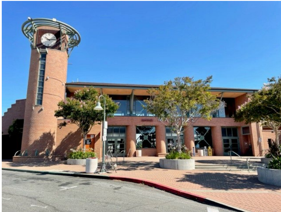
Martinez Intermodal Train Station

Intermodal Train Station: The Intermodal Station is located at 601 Marina Vista and provides a state-of-the-art train station currently operated by Amtrak.