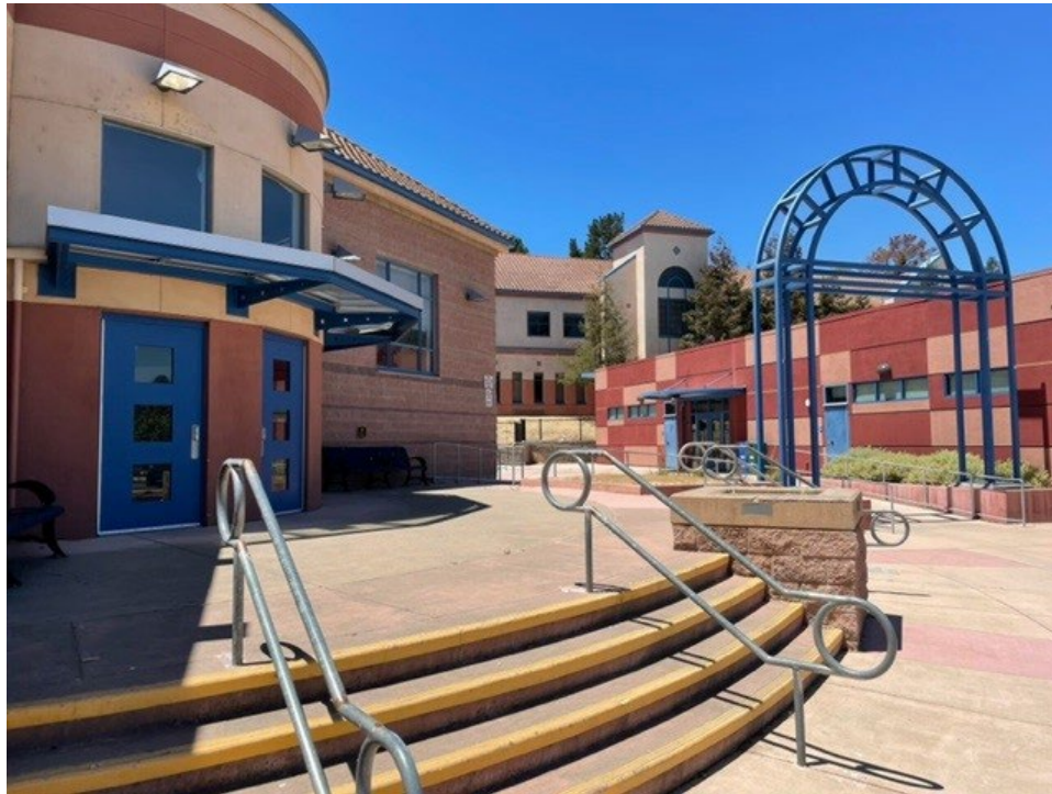
Alhambra High School

the City limits, and serves Martinez school children in other facilities outside of the City. Based on student enrollment analyses conducted by MDUSD and MUSD, all facilities were determined to have been able to adequately serve the Martinez community through the 2021/2022 school year.