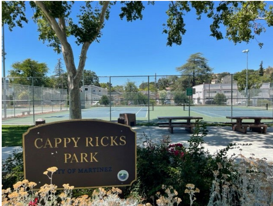
Cappy Ricks Park