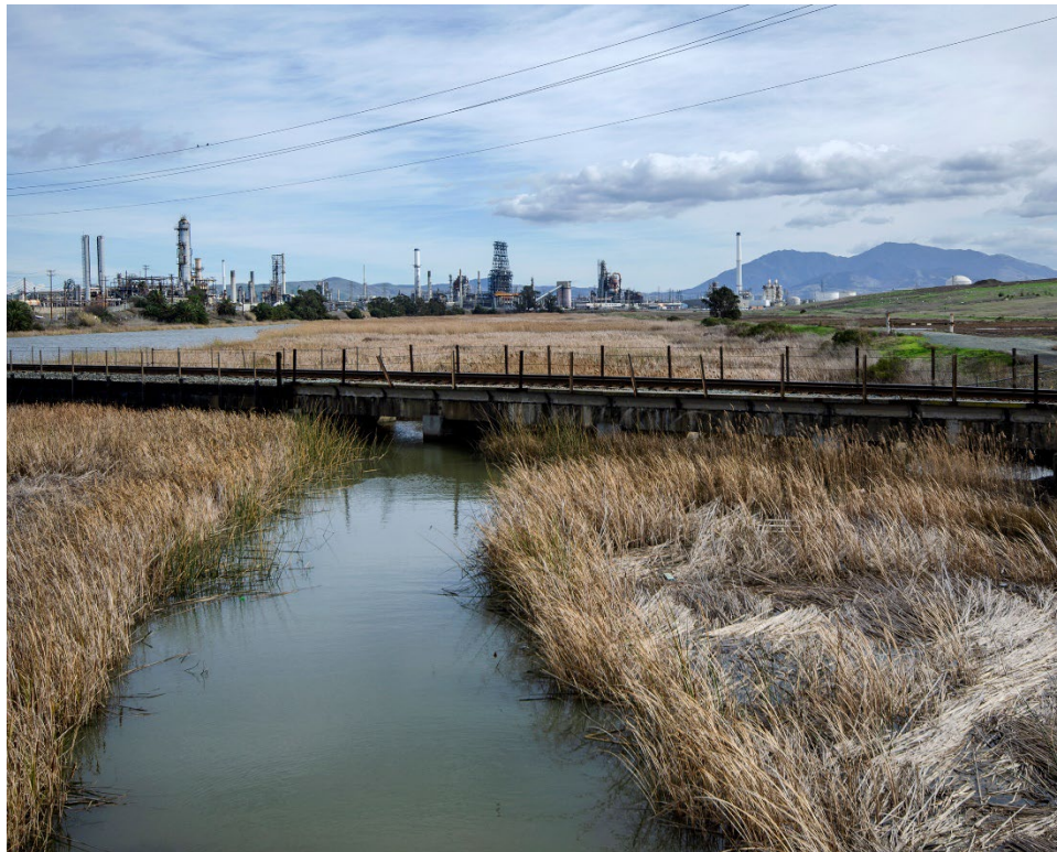
View of Refineries from Martinez Marshlands