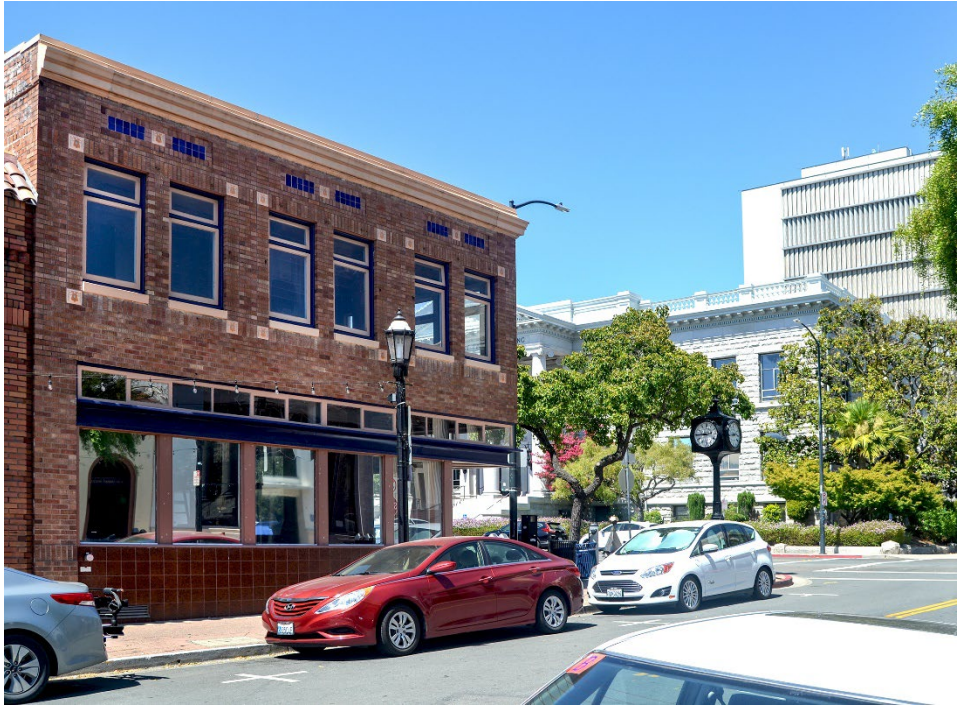
Downtown Martinez