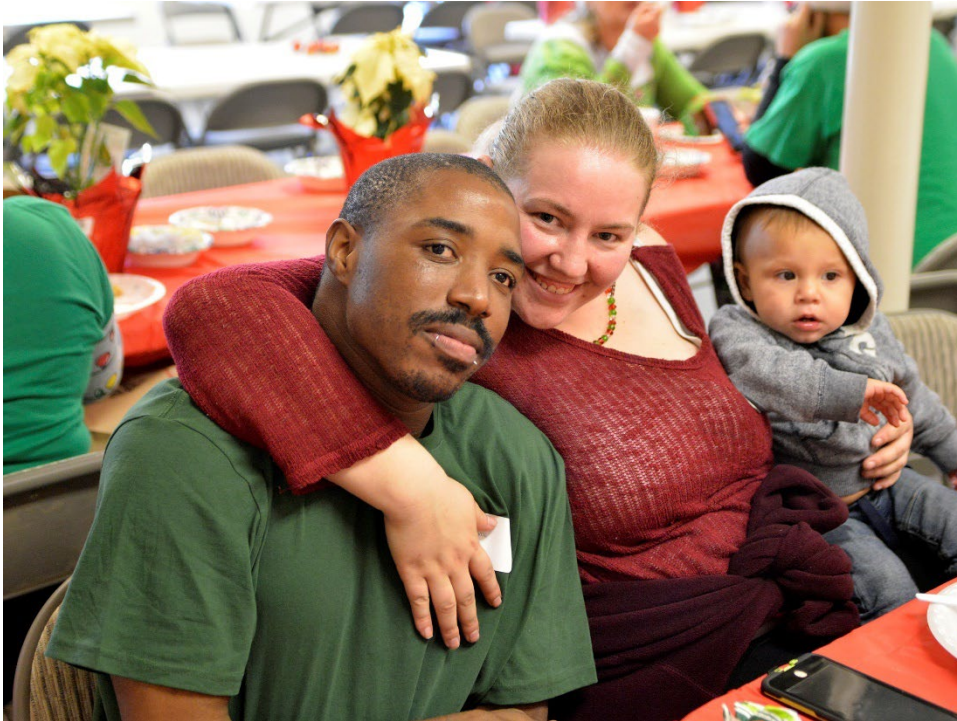
Martinez Residents