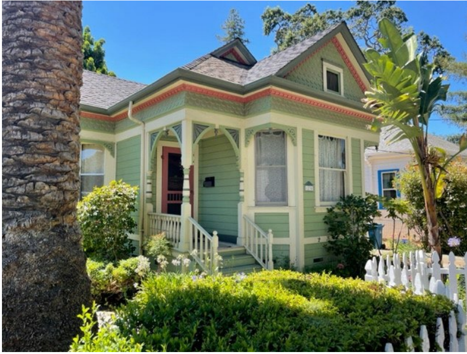
Victorian Home in Central Martinez