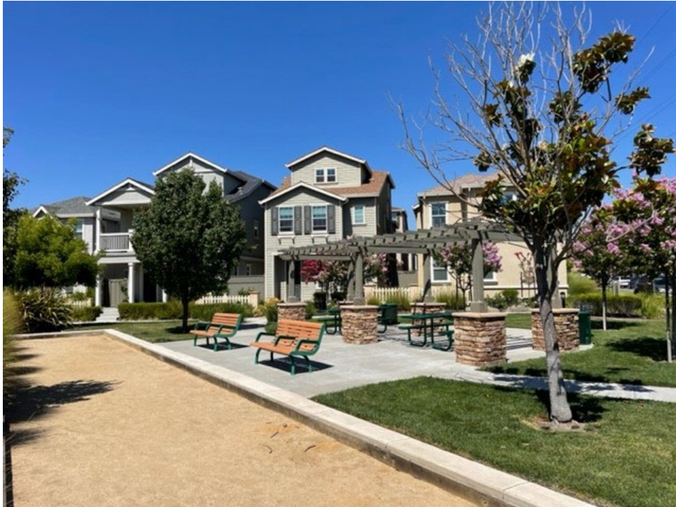
Townhomes on Parkway Drive

neighborhoods. Pursuant to current LAFCO policies for the eventual annexation of out-of-area service areas, the City annexed a portion of Alhambra Valley developed in the 1990s. Future annexations will be considered at appropriate times. One area with the potential for additional development (consistent with both the City's and County's land use plans for the area), is the North Pacheco corridor of Pacheco Boulevard, just west of State Route 4.