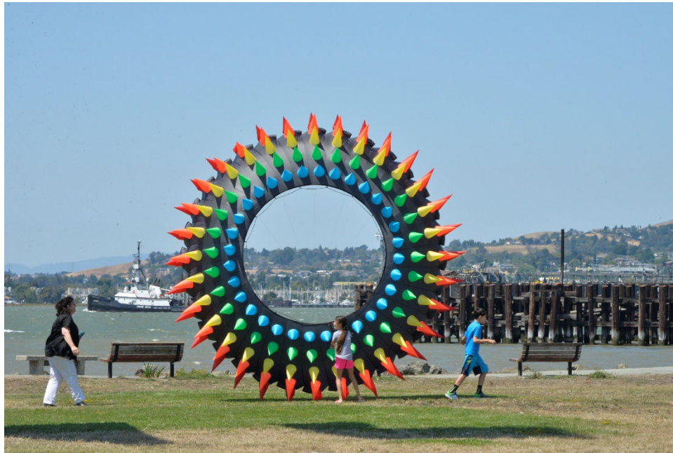
Kite at Radke Martinez Shoreline

Conservation does not preclude growth; rather, it calls for more efficient use of resources and an understanding of the interrelatedness of natural and manmade systems. Typically, conservation is thought of as preserving natural lands, but it also includes other important concerns such as water, energy, and resource use. While there are numerous ways to address these issues, one of the easiest ways to begin is by addressing tangible local conservation concerns. In the case of Martinez, this means preserving open space, our primary natural resource, given its significant role in bolstering the City's identity and vitality. In addition to open space, this Element also addresses the following topics as they relate to local circumstances: agriculture and mineral resources; biological resources; watersheds; water quality; air quality; and energy and resource use.