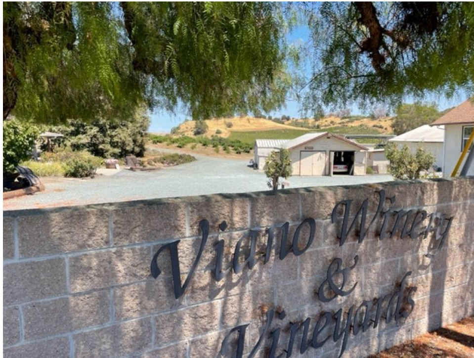
Viano Winery & Vineyards on Morello Avenue

sold for residential development. This required a rezoning of the property from open space and recreation to low density residential use. Litigation ensued after City Council approval of the rezoning. The settlement agreement designates approximately 9.5 acres as open space and recreation use, and the remaining approximately 15.5 acres as low density residential. The largest portion of the open space of 8.22 acres will become a neighborhood park and has been added to the list of parks in the Parks & Community Facilities Element. The park's addition will create greater public access and use for a portion of the area that was previously restricted to golfers. The reduction in open space for the remaining area rezoned to residential is offset by the potential creation of approximately 60 homes that will be added to the housing supply to meet a portion of the City's state mandated housing production goals. The land use map ( Figure 2-4 ) in the Land Use Element reflects the reduction of open space for this parcel.