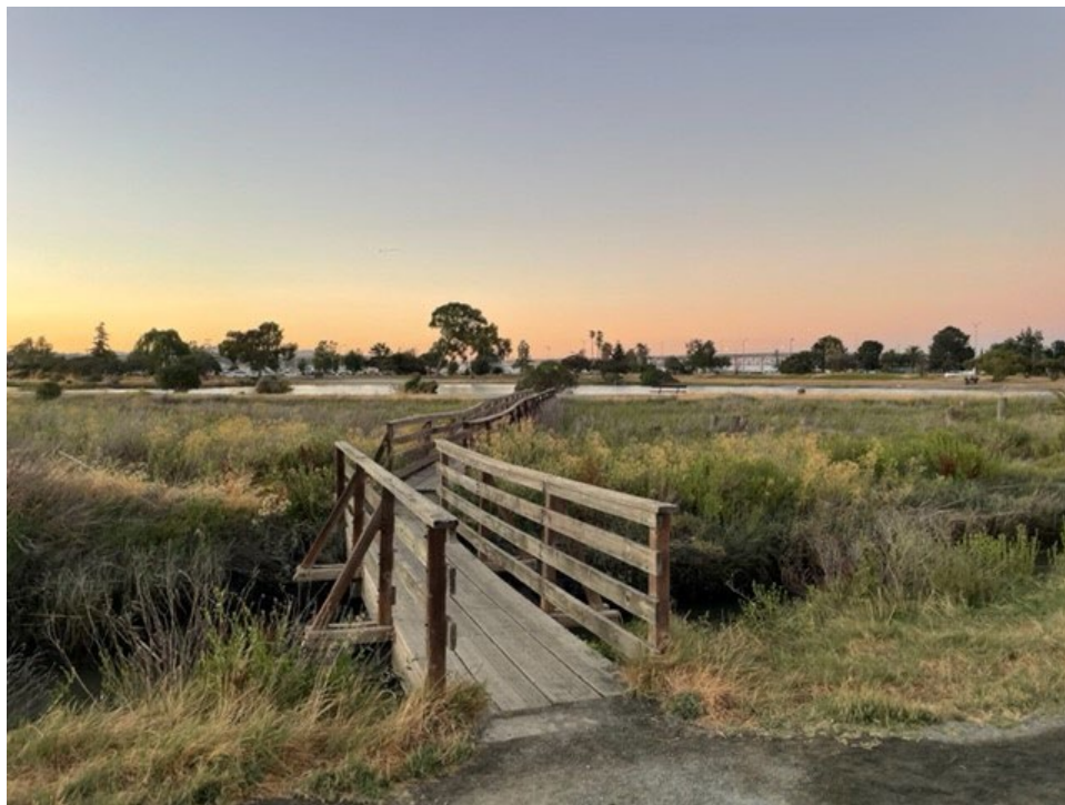
View from Radke Martinez Regional Shoreline

In addition to habitat and scenic value, open space in Martinez serves agricultural purposes, and provides for public health and safety by supplementing City flood control efforts, reducing the urban heat island effect, removing toxins from our air and water, and more. For these and other reasons it is important for the policies in this Element to guide development in a manner that protects lives and property while preserving the benefits open space provides.