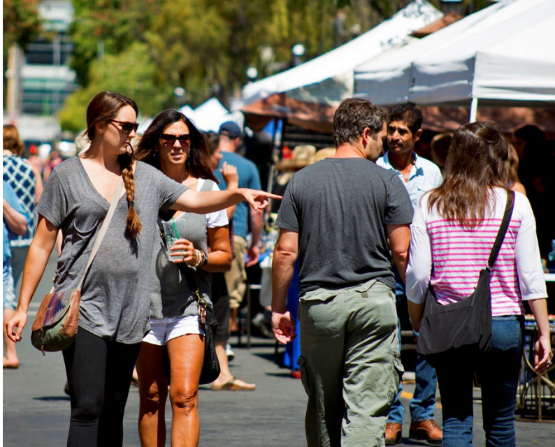
Downtown Martinez Makers Market

and setback limits, lot coverage, parking and other development parameters within each zoning district. Following the adoption of this General Plan, the City of Martinez will begin a comprehensive update of its zoning ordinance to make existing zoning regulations consistent with the General Plan.