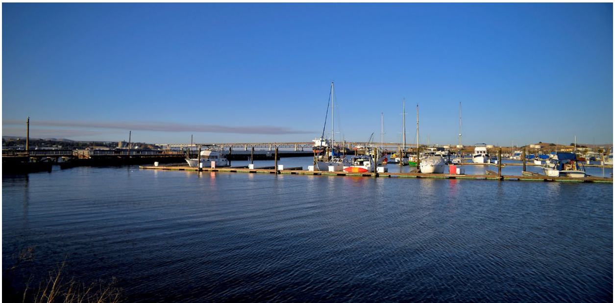
Martinez Marina