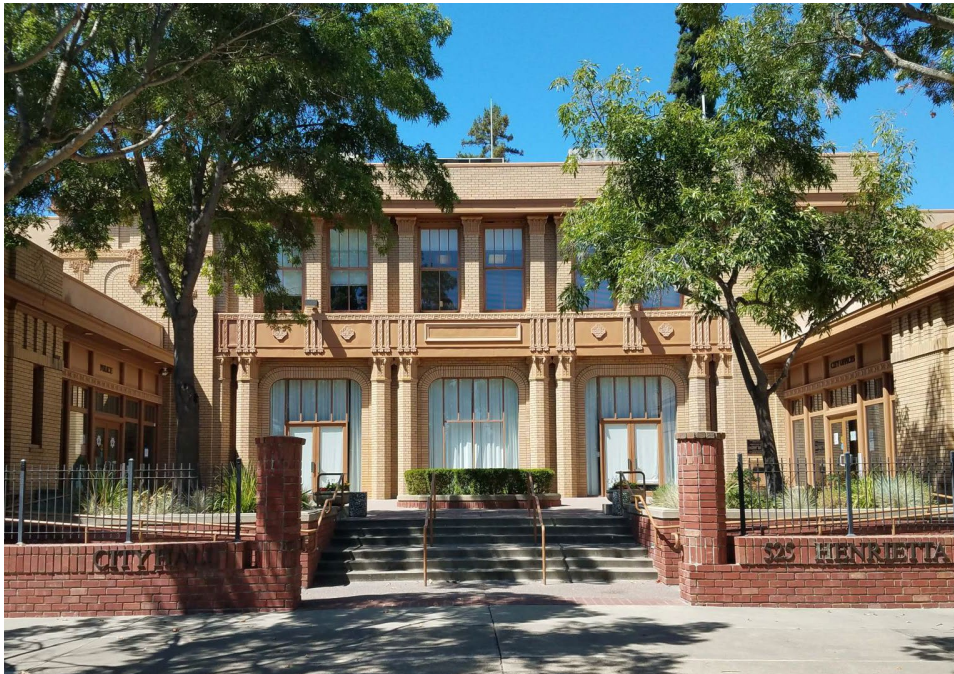
Martinez City Hall

The State’s general plan requirements are intended to link regional transportation and housing plans to greenhouse gas (GHG) reduction goals. The Metropolitan Transportation Commission (MTC) and the Association of Bay Area Governments (ABAG) have linked the Regional Housing Needs Allocations (RHNA) process with the Regional Transportation Plan (RTP) process in developing a Sustainable Communities Strategy (SCS) as a way of reaching GHG reduction targets. Under the Bay Area’s SCS ( Plan Bay Area 2050 ), Downtown Martinez is identified as a regional Priority Development Area (PDA), meaning it is a locally-identified, infill development opportunity area where there is local commitment to developing more housing along with amenities and services to meet the day-to-day needs of residents in a pedestrian-friendly environment served by transit.