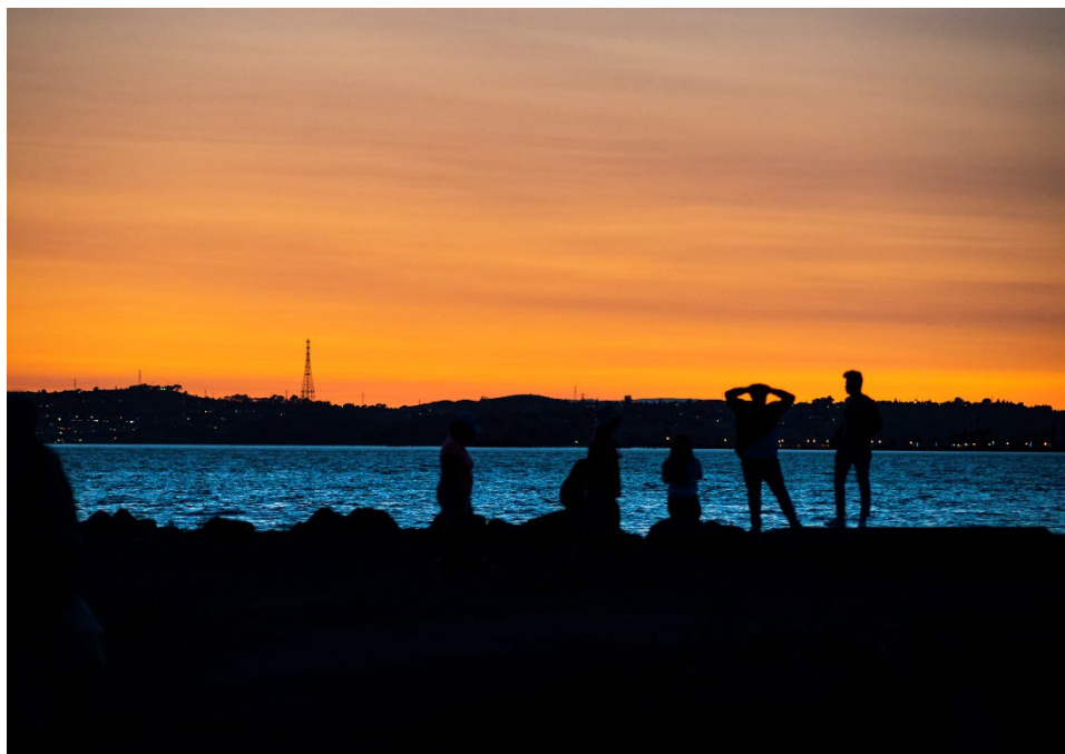
Martinez Waterfront