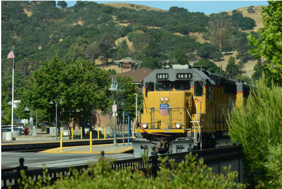
Union Pacific Train