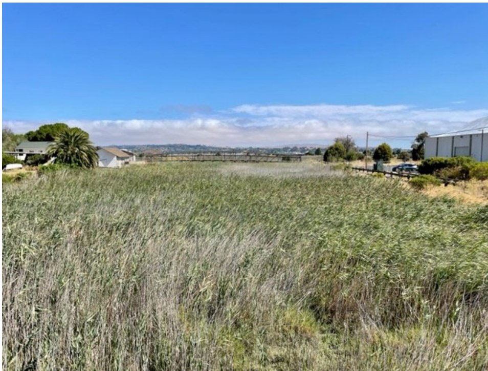
View east of former Granger's Wharf

Natural topography is often preferred as open space and can be property owned by the City or other public agencies (i.e. East Bay Regional Park District, National Park Service, etc.) for the purpose of public recreation and/or preservation of scenic and natural resources, or it may be private lands with land use regulations or easements restricting use to open space. Examples of unique natural areas include the waterfront; City/East Bay Regional Park District lands at Franklin Hills and Shoreline; wetland areas; Mt. Wanda; Schaefer Memorial Open Space; and Hidden Lakes and Roanoke (Virginia Hills) O o p p e e n n S s p p a a c c e e A a r r e e s s . These defining natural topographic features may include private lands that have either extreme constraints to development, such as steep slopes or scenic resources to preserve.