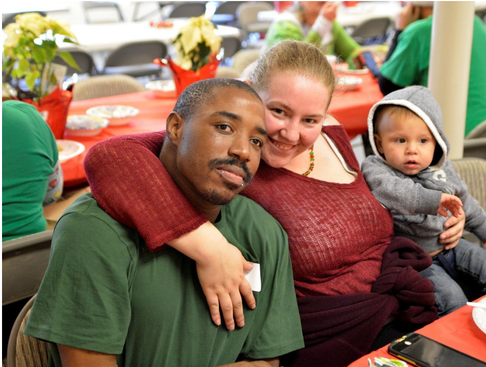
Martinez Residents