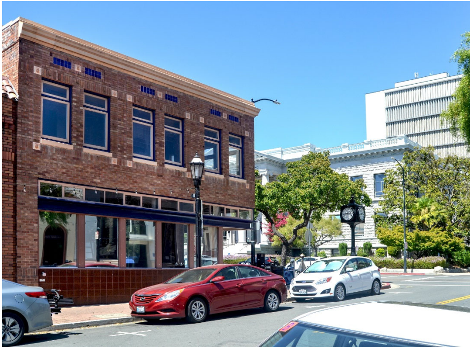
Downtown Martinez