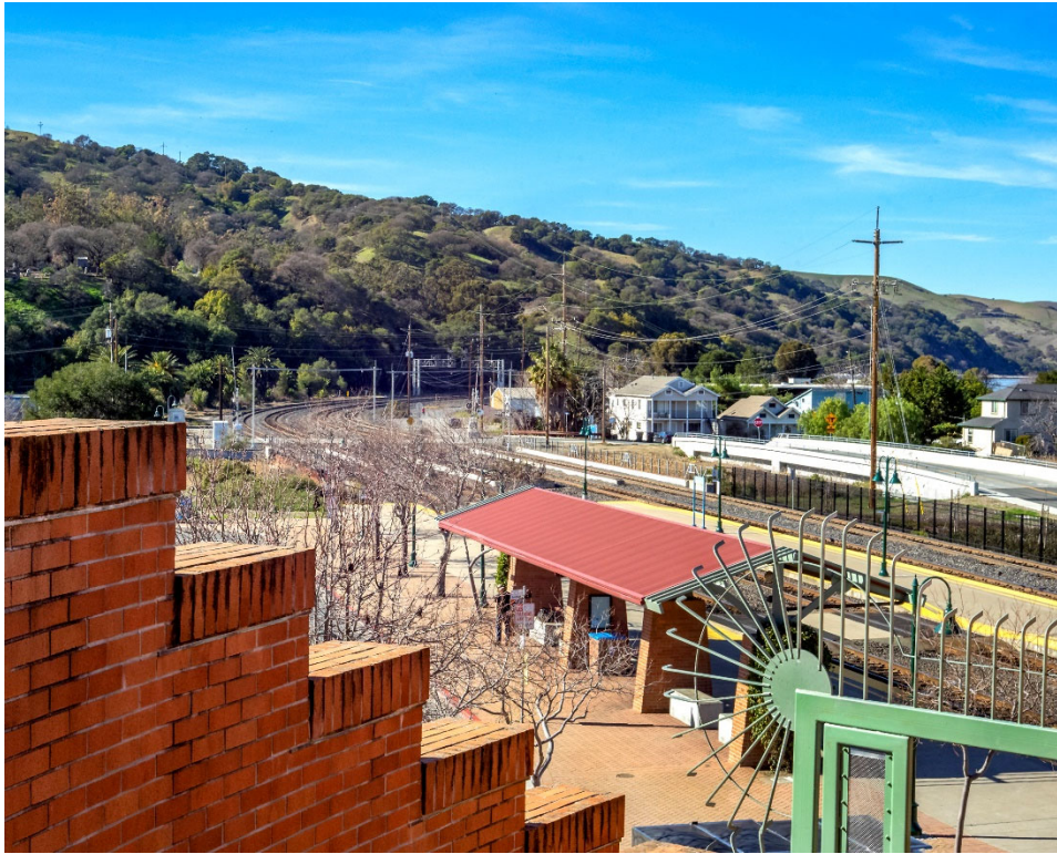
View of Franklin Hills

Downtown Neighborhoods: This area surrounding the Downtown Core is defined by the presence of existing older service commercial/industrial and eclectic uses. It is an area in transition and, as such requires balancing retention of current uses, while encouraging the ultimate replacement of such uses with a variety of more intense uses which can better define a traditional mixed-use urban environment and encourage the introduction of more residential uses as outlined in the 2006 Downtown Specific Plan .