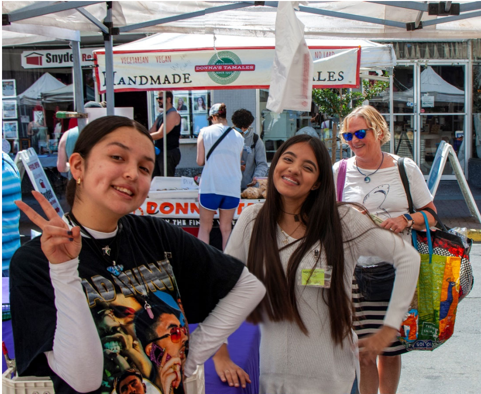
Martinez Youth Volunteers

As a mature community, it is critical that Martinez think strategically about how and where reinvestment should occur and where it is appropriate for limited new development to take place. The overarching goal is to conserve those parts of the City that have value the way they are and to direct redevelopment to areas where land may currently be underutilized.