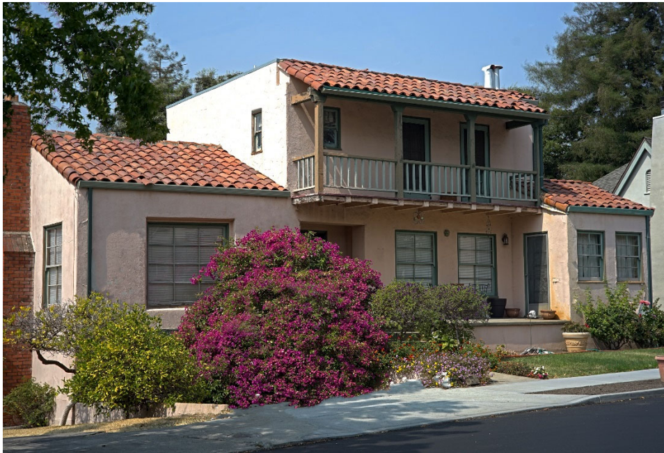
Single-Family Home on Brown Street

John Muir Parkway Specific Area Plan: This specific area plan includes the area north of Highway State Route 4 from the eastern edge of the City at Interstate 680 to approximately Howe Road on west. The area is developed with a mixture of low, medium and high density residential, commercial and open space uses. Land uses are reflected in the new categories of low, medium and high residential, and commercial and regional commercial. Open space areas are designated Open Space (OS).