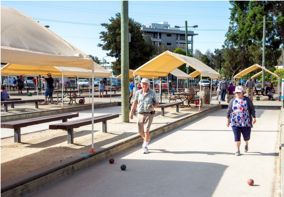
Ken Bothée Bocce Courts at the Martinez Bocce Courts Complex

The majority of the area is owned by the State of California Trust Land Commission (SLC). The SLC has granted control over various parts of the waterfront to EBRPD and the City. Per State law, use of Public Trust lands is generally limited to water-dependent or water-related uses, including commerce, fisheries, and navigation, environmental preservation, and recreation. Recognized Public Trust uses include, among others, public access, ports, marinas, docks and wharves, buoys, hunting, fishing, bathing, swimming, and boating. Ancillary or incidental uses—uses that are not independently Public Trust-consistent but that are supportive and necessary for trust use, or that accommodate the enjoyment of Public Trust lands—are also permitted; examples include facilities to serve visitors, such as hotels and restaurants, shops, parking, and restrooms. Other examples of acceptable ancillary uses are commercial or industrial facilities that provide support to water-dependent uses that must be located on or directly adjacent to the water, such as warehouses, container cargo storage, and facilities for the transfer of oil and gas products through marine oil terminals. Public Trust lands may also be kept in their natural state for habitat, wildlife refuges, scientific study, or use as open space. These State use limitations inform the land use policies of the Martinez General Plan for the waterfront area.