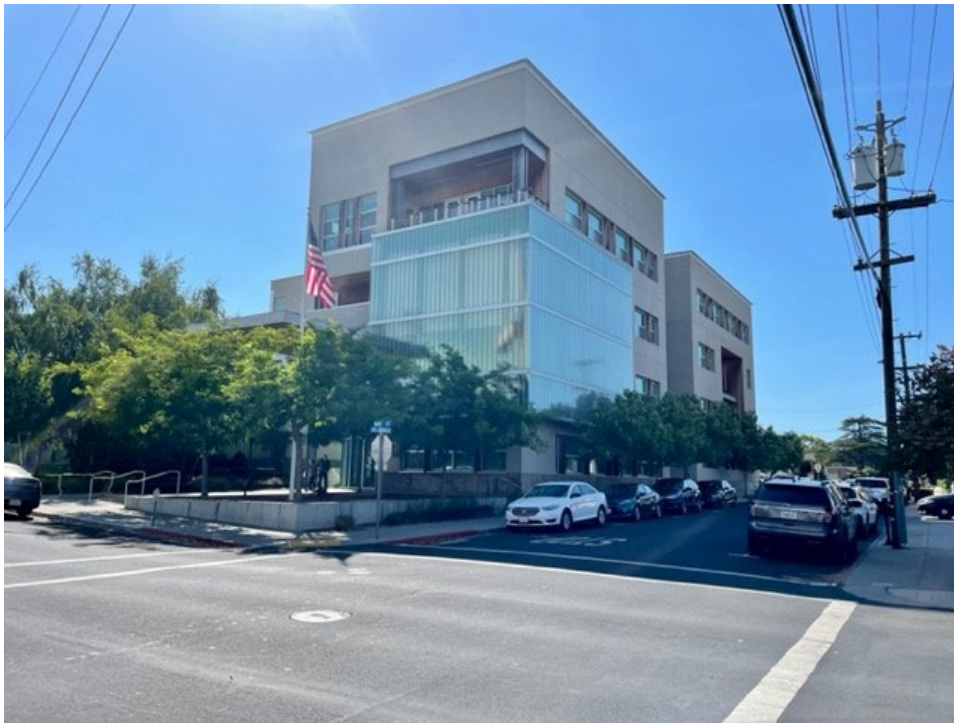
Contra Costa County District Attorney's Office

GF (Government Facilities); PA (Professional and Administrative Office)