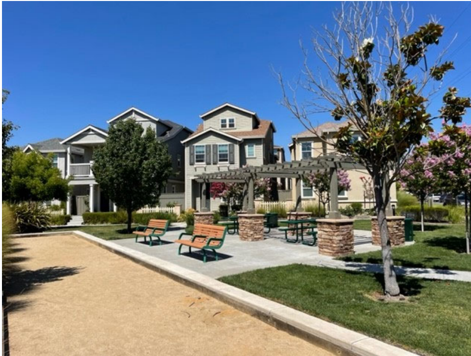
Townhomes on Parkway Drive