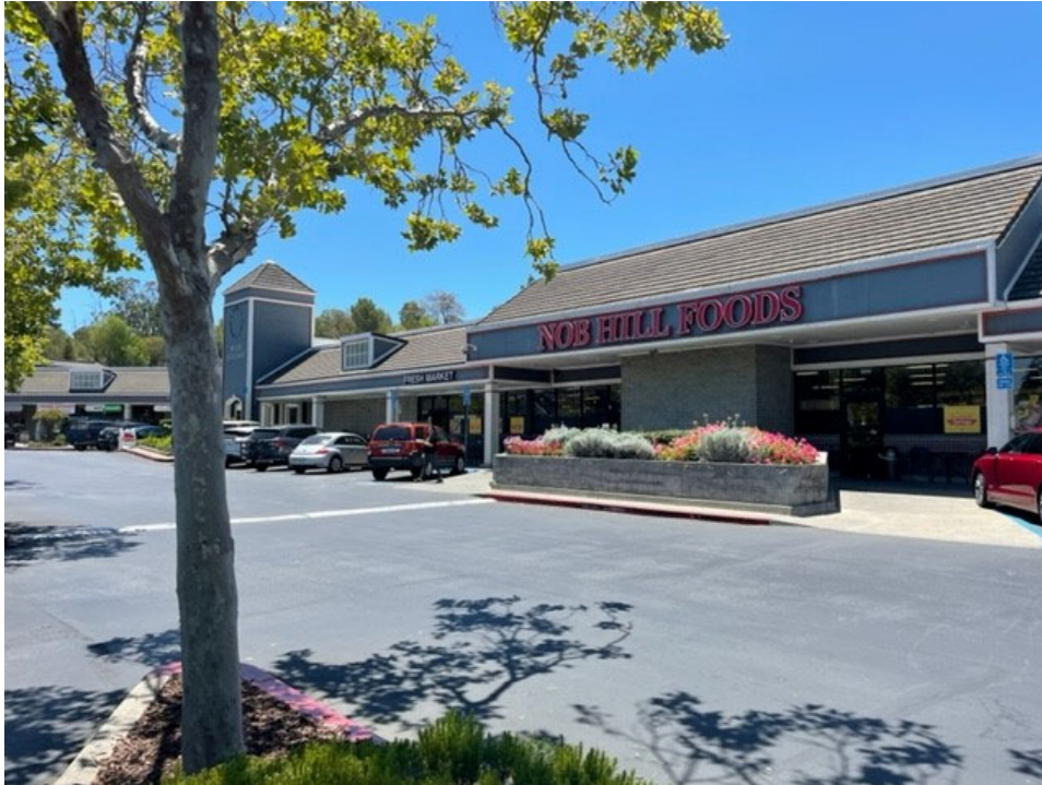
Muir Station Shopping Center

Heavy Industrial Area: The heavy industry descriptor is typified by the petroleum industry. This includes the northeast quarter of the City near Interstate 680 which and includes contains petroleum industry and equivalent uses. Other uses in this area include light industrial uses, landscape contractor yards, and manufacturing companies.