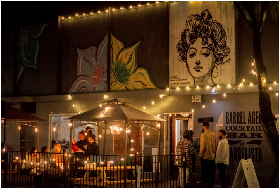
Martinez Nightlife

Policy LU-P-12.6: Develop a plan for pedestrian connections in the Downtown such as plazas and paseos.