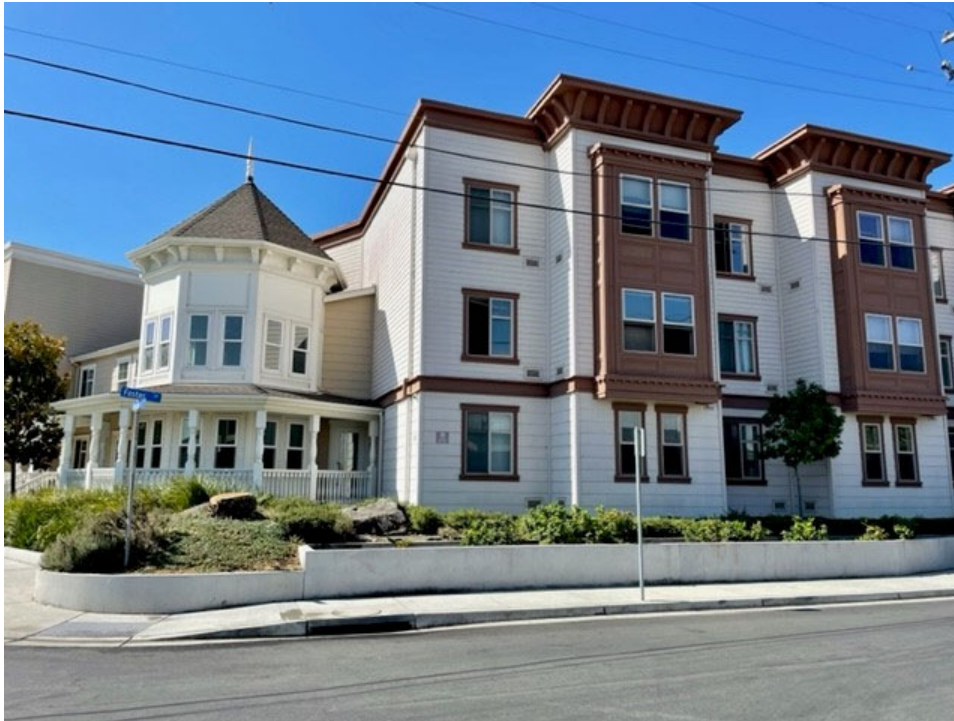
Medium Density Housing west of Downtown Martinez

The intensity of commercial and industrial development on any site shall respond to the following factors: site resources and constraints, traffic and access, potentially hazardous conditions, adequacy of infrastructure, and City design policies. Maximum development allowable is not guaranteed, particularly in environmentally sensitive areas. In residential areas and for residential uses in mixed use developments, density is expressed as the maximum number of dwelling units allowed per acre of land. In commercial and industrial areas, intensity is expressed using floor area ratios (the ratio of building area to lot area).