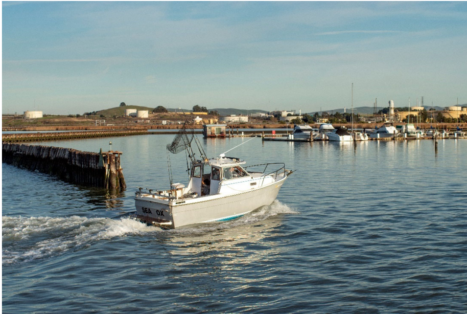
Martinez Marina