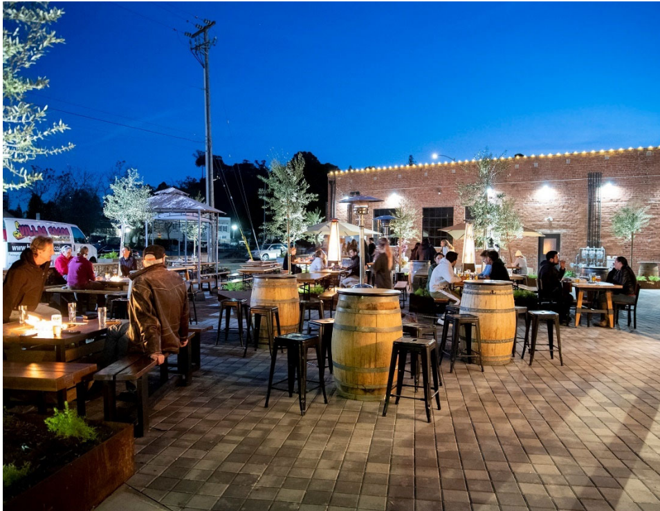
Downtown Martinez Nightlife

Policy LU-P-11.1: Promote business assistance services, including seminars, linking local businesses to financial and technical resources, supporting local business promotion, and networking.