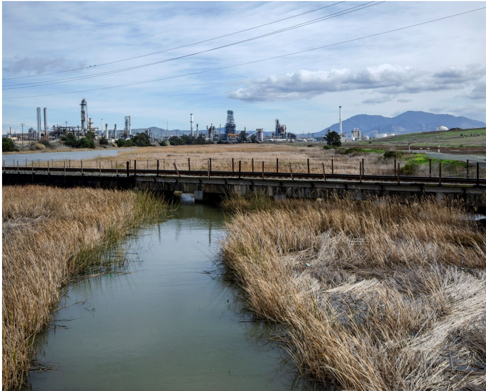
View of Refineries from Martinez Marshlands

2.7 Land Use Element Goals, Policies, and Measures: This section lists the goals, policies, and implementation measures for the Land Use Element.