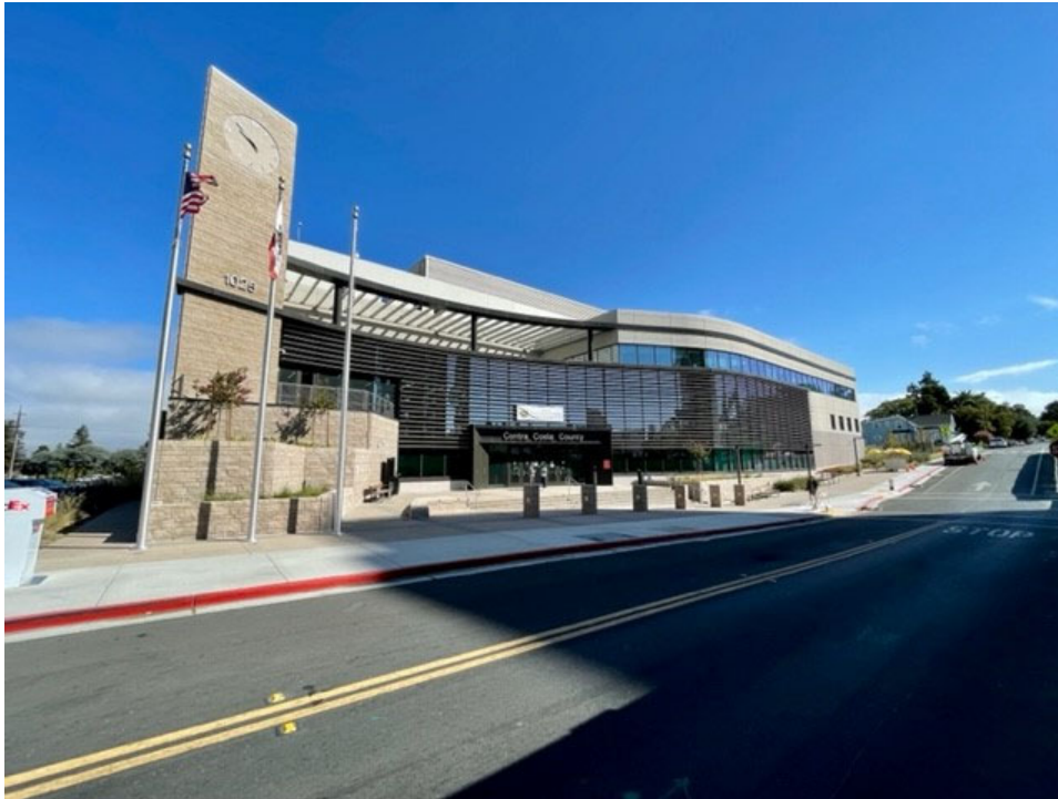
Contra Costa County Administration Building in Downtown

Downtown Shoreline: The portion of the Downtown Shoreline north of the railroad contains two distinct sub-areas: 1a ) the existing residential Granger's Wharf neighborhood along Berrellesa Street and 2b ) the industrial uses along Embarcadero Street (Bisio Property at 310-314 Embarcadero Street) . The Granger's Wharf area retains its historic character from the Italian Fishing Village that existed before commercial fishing was banned along the Carquinez Strait in 1957. The established residential uses and character of Granger's Wharf should be maintained, although expansion of East Bay Regional Park District's facilities, as the access into the wetlands portion to the Radke Martinez Regional Shoreline, may be considered. Limited recreation oriented commercial uses may also be possible in the Granger's W wharf sub -area.