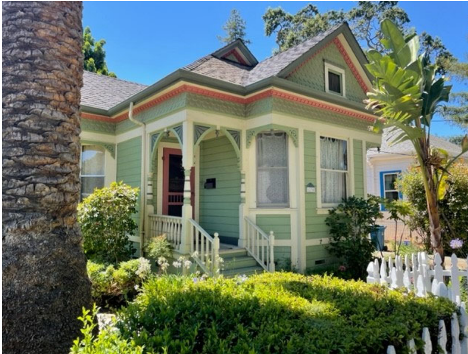
Victorian Home in Central Martinez