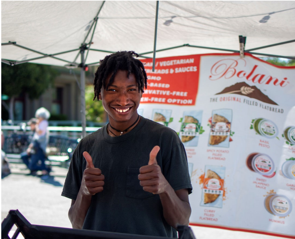
Small Business at Martinez Farmer's Market

Policy LU-P-11.2: Promote City marketing and branding efforts and support similar coordinated private business efforts.