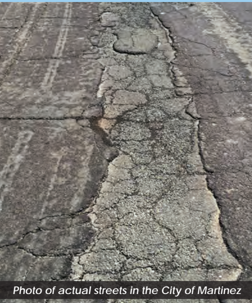
Photo of actual streets in the City of Martinez