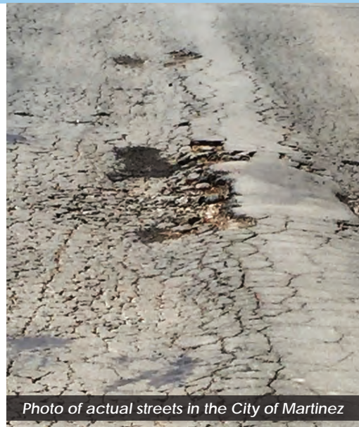
Photo of actual streets in the City of Martinez